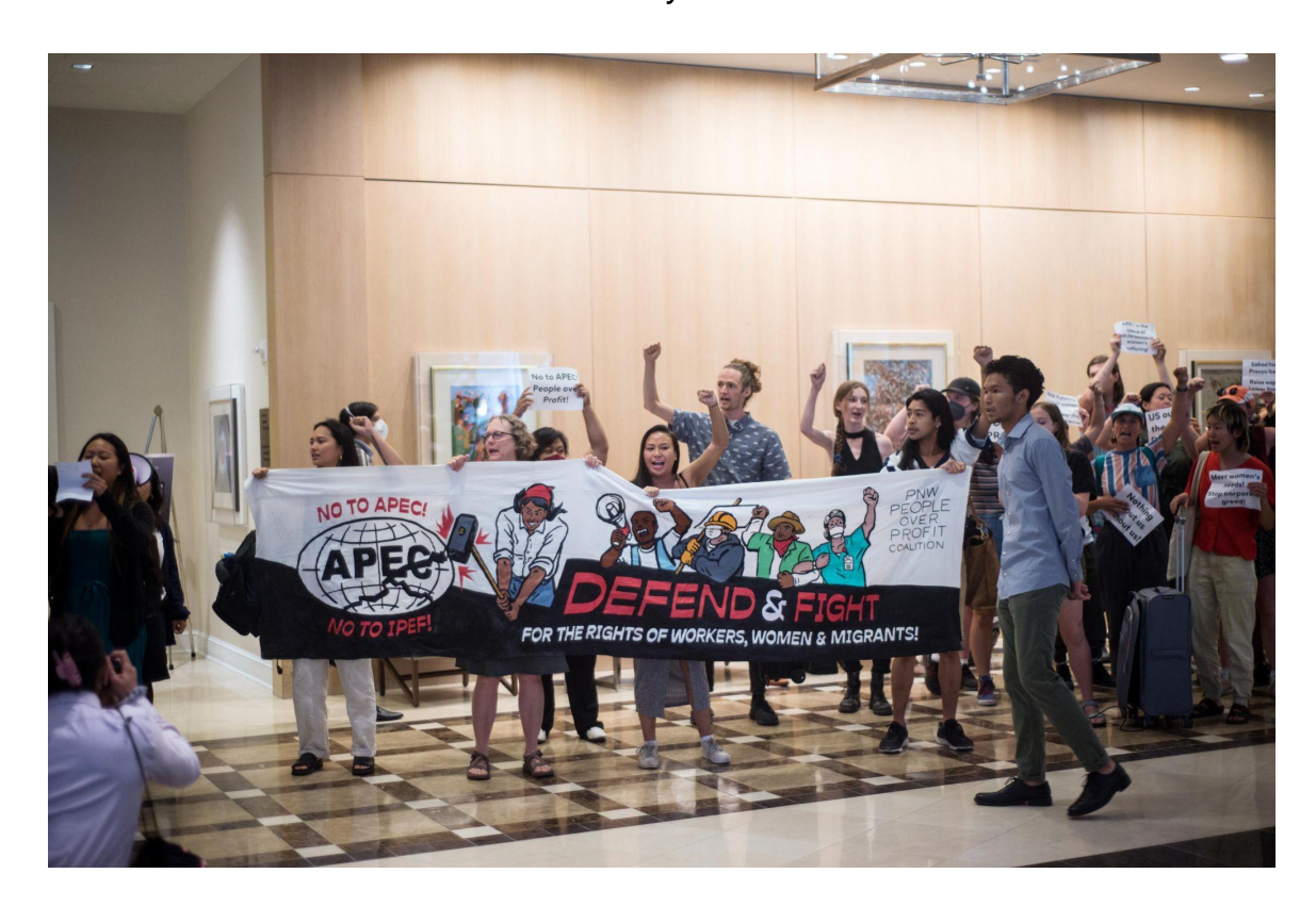
Activists in the lobby of the Grand Sheraton hotel staged a flash mobilization, chanting "no to APEC" they were joined by the organizers from the second floor