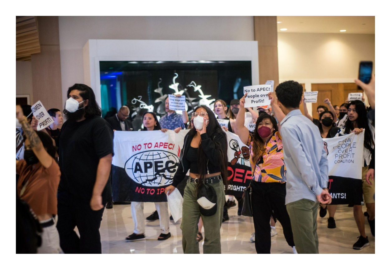
Activists moved from lobby of the Sheraton to outside - continuing to amplify the demands that APEC put women over profit