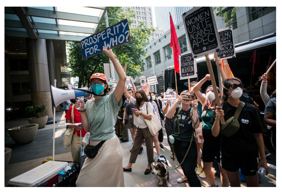
Protesters outside the Sheraton hold signs "Prosperity for Who" and "Women unite against APEC"