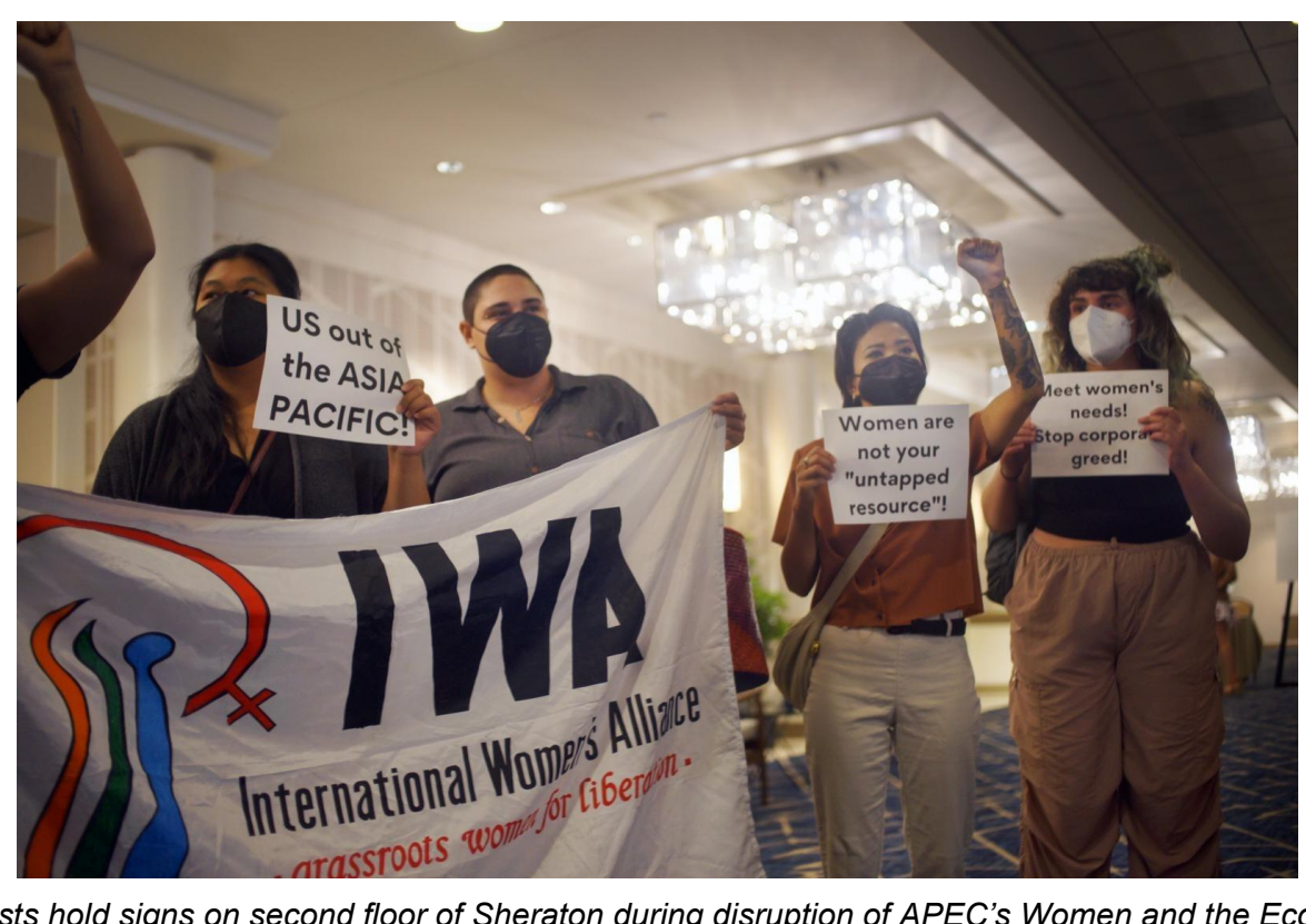
Activists hold signs on second floor of Sheraton during disruption of APEC's Women and the Economy Forum