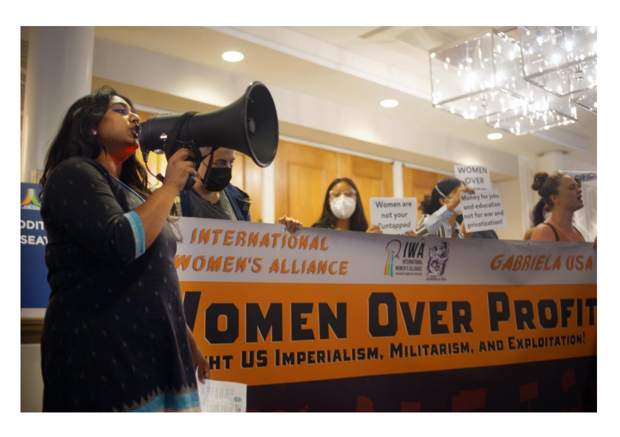
Activists hold signs and a banner in front of the Grand Ballroom during APEC's Women and the Economy forum