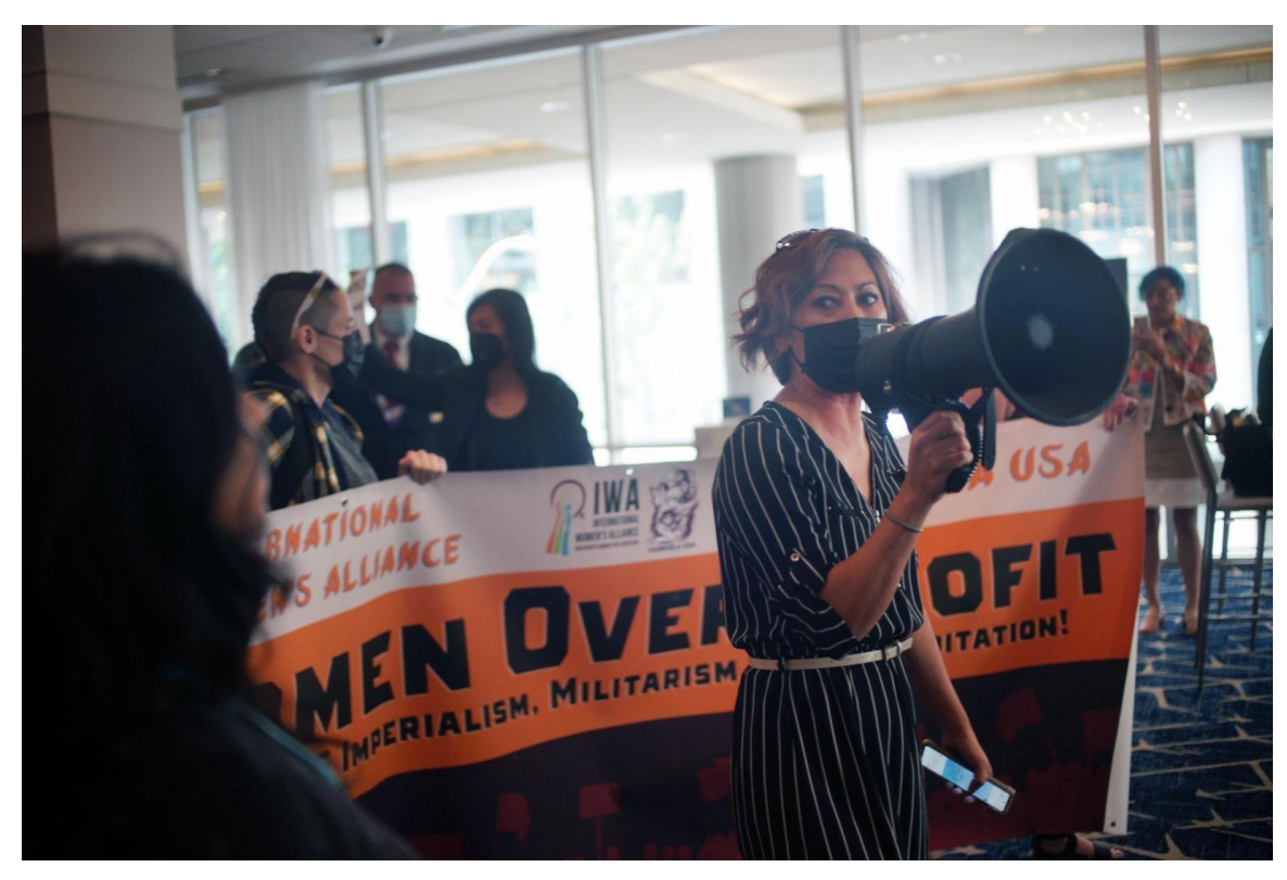
Activists disrupted APEC's Women and Economy Forum on the second floor of the Sheraton with chants demanding "Women Over Profit!"