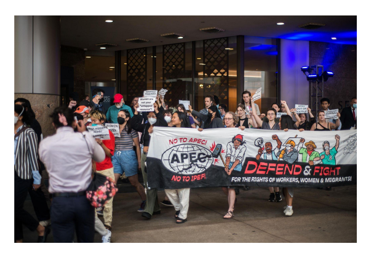
Activists move outside the Sheraton - where they joined with even more protesters and heard from speakers in from tech, agriculture, labor. Climate, migrant, and healthcare sectors